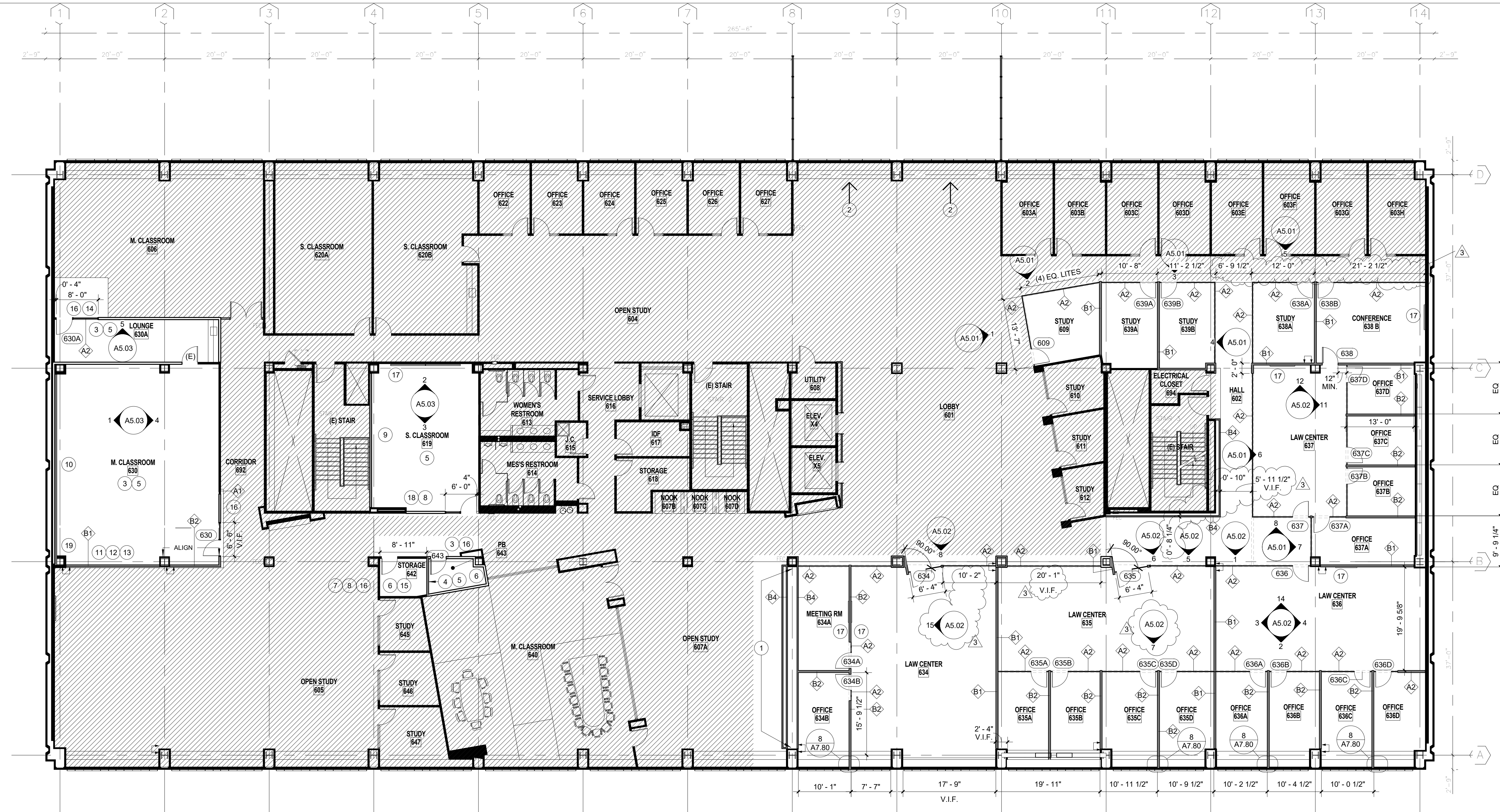
1 6TH FLOOR PLAN 3/32" = 1'-0"